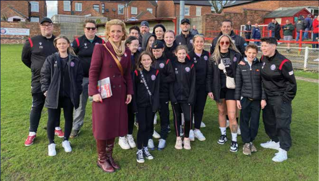
Samantha Niblett MP visiting the club to see the girls and ladies team

Our key is to have players that will always have Gresley Rovers at their heart. To that end some of you will have noticed a subtle change to the badge this season? It now reads Gresley Rovers Football Club, which all teams will wear as new kits are brought on line. This represents the togetherness of all of the teams throughout the club and show we are just one club.