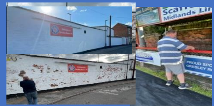
Exterior wall post paint job.. and before!!

weeks and we wish to place on record our huge thanks to everyone who spent their free time helping with the 60+ tasks we identified as needing doing when the board took a walk around the ground with our volunteer ground staff. A truly brilliant effort indeed from all involved. Thankyou all