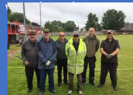
Some of our amazing volunteer ground staff pose for a picture

During the summer weeks we took the decision to give the Moat Ground one last spruce up ahead of the coming season. Through a combination of our amazing band of hard working volunteer ground staff, board members and lots of supporters coming up to help during some volunteer days everyone has done an amazing job of giving the place a much needed tidy up ahead of the new season and you can certainly see the difference this has made. Hundreds of volunteer hours have gone into this work in recent